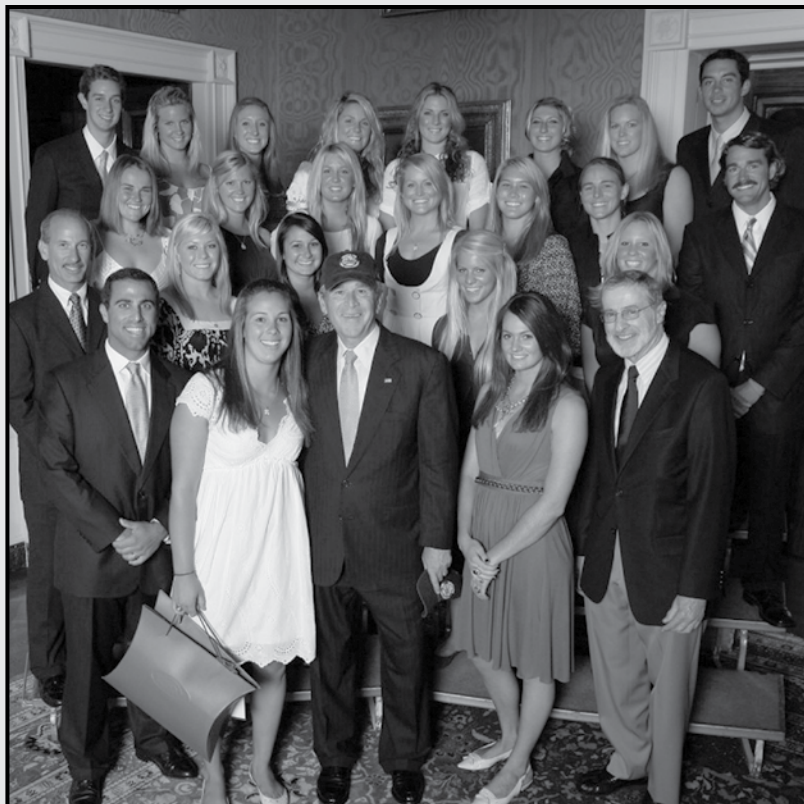
The 2007 UCLA women's water polo team met President George W. Bush at the White House last summer